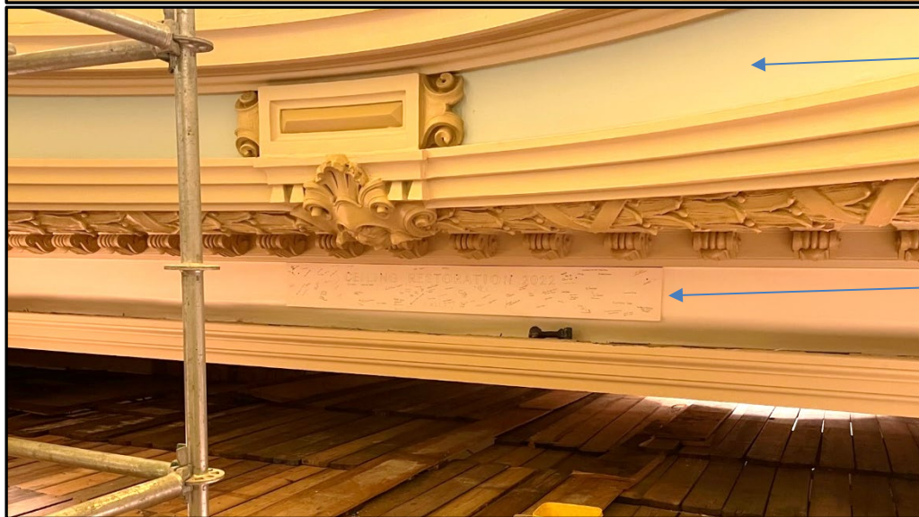
Bottom Ring of Dome