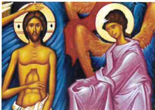
4. An angel of the Lord receives Christ as He comes out of the water (detail).

On the right side of the icon angels are shown with their heads bowed in reverence to Christ (3). They are prepared to receive Him as He comes out of the water (4).