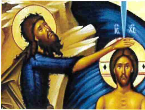
1. Saint John the Baptist conducts the Baptism of our Lord and Savior Jesus Christ (detail).

The Icon of the Feast of Theophany tells the story from the Gospels in images and color. On the left side of the icon we see John the Baptist (1) who is dressed in camel's hair and has the appearance of one who lives in the wilderness. His arms are outstretched, showing an attitude of prayer and reverence, but also directing others to Christ. With his right hand he is conducting the baptism.