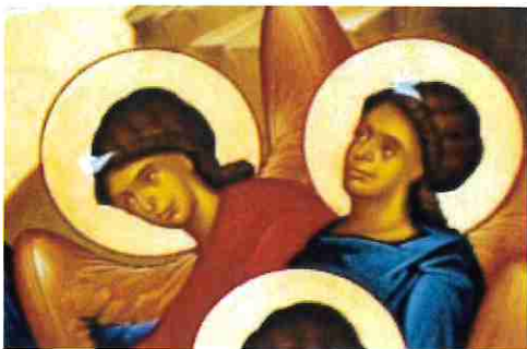
3. Angels of the Lord gathered on the shore of the Jordan River give praises to Christ (detail).

In the center of the icon is Christ being baptized in the Jordan. He is standing in the water wearing a waistcloth, and with His right hand He is blessing the waters of the Jordan. Above His head is the Holy Spirit descending as a dove upon Him (2). At the top of the icon, a semicircle depicts the opening of the Heavens and the voice of the Father.