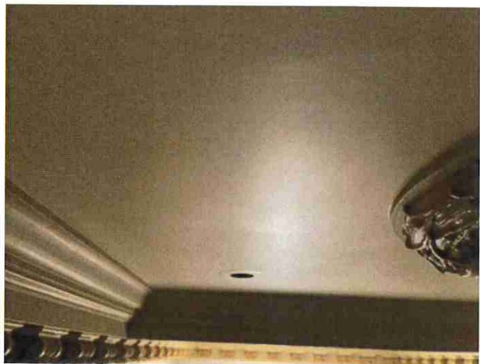
Sample of new surface finish. The forward portion of this picture is the section the fell onto the pews and aisle