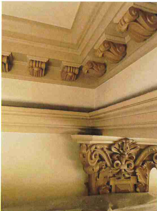
Sample of plaster detail in the ceiling and the multi-color paint scheme

We have made excellent progress over the past several weeks. On December 27, the painting was completed! This effort included painting several patches of the walls. These wall areas were included in the project because they had peeling paint and were easily accessible with the scaffolding in place. The pictures below show both the amount of detail involved in the painting and the quality of the finished product.