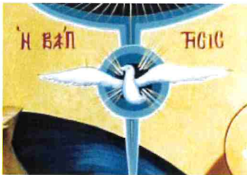
2. The Heavens open, the voice of the Father is heard, and the Holy Spirit in the form of a dove descends upon Christ (detail).

In the center of the icon is Christ being baptized in the Jordan. He is standing in the water wearing a waistcloth, and with His right hand He is blessing the waters of the Jordan. Above His head is the Holy Spirit descending as a dove upon Him (2). At the top of the icon, a semicircle depicts the opening of the Heavens and the voice of the Father.