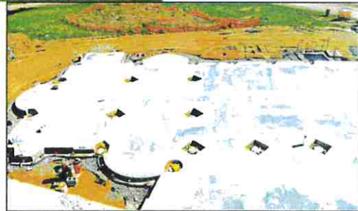
Chapel concrete slab poured

Donate to build for the Glory of God & the intercessions of His Holy Mother, The Theotokos.