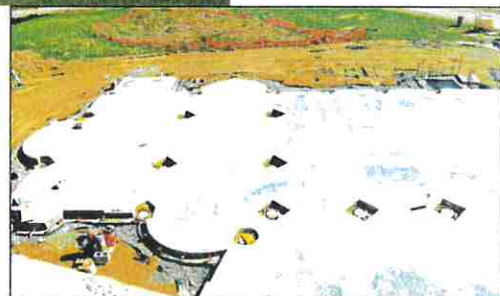
Chapel concrete slab poured

Donate to build for the Glory of God & the intercessions of His Holy Mother, The Theotokos.