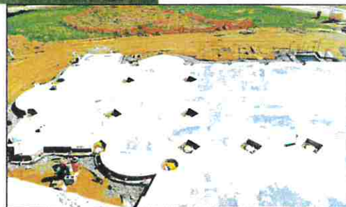
Chapel concrete slab poured

Donate to build for the Glory of God & the intercessions of His Holy Mother, The Theotokos.